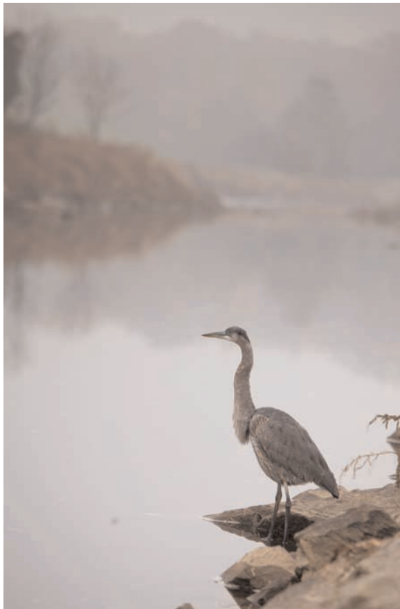
The new summer camp will teach students about the Anacostia River and wildlife like this great blue heron.

career in art because of a program like ours that took her on a field trip to the Smithsonian. The experience changed her life, just as the programs of the Daniel DiTondo Foundation are changing the lives of this generation of students. And we couldn't do it without your support. Our sincere thanks to all of you!